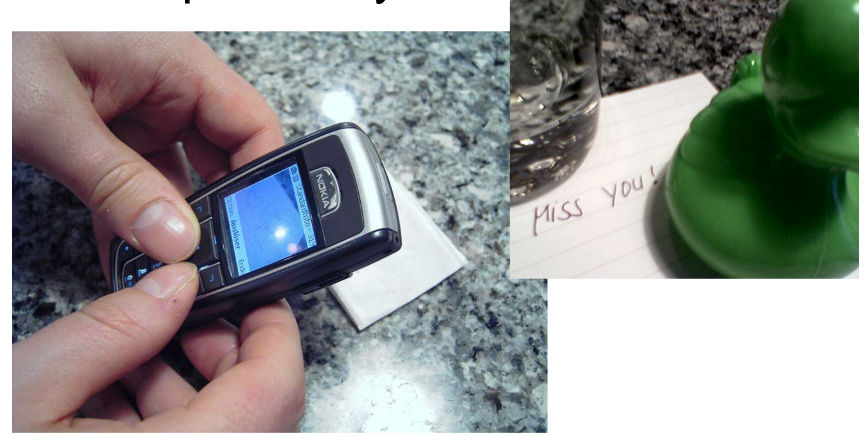
Write on paper → capture on photo → send as MMS

How do we interact with mobile and ubiquitous systems?