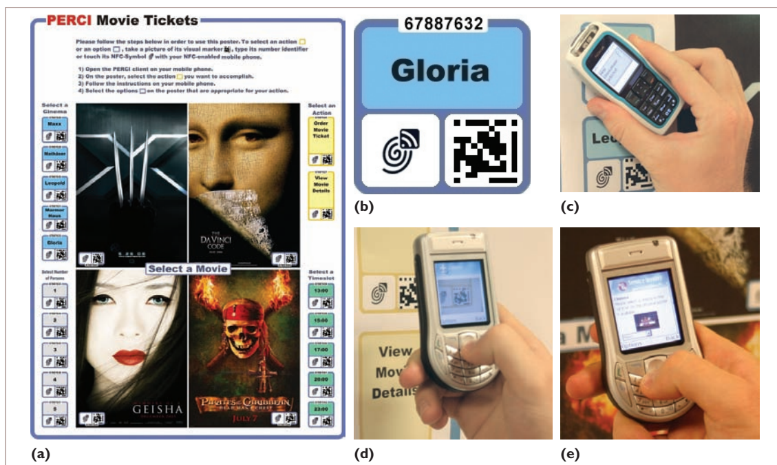
Figure 3. Poster for mobile ticketing. The (a) poster contains (b) tagged options that support the interaction techniques (c) touching, (d) pointing, and (e) direct input of numeric identifiers.

niques in alternate order. We tested touching and pointing with a Java ME application and direct input with a mobile HTML browser to cover all supported client platforms.