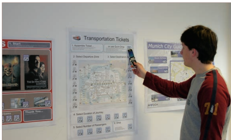
Figure 1. Physical mobile interaction (PMI) with multiple tags and objects. Tagged objects can serve as physical user interfaces that facilitate interaction with associated information and services. (Research prototypes include material from www.actuacine.net and www.mvg-mobil.de .)

The Perci architecture is divided into three main parts (Figure 2): mobile devices interact with tagged physical objects that are associated with Web services and provide information for their invocation – for example, a poster for a movie-ticketing service. The generic universal client on mobile devices comprises modules to handle the interaction with tagged objects ( interaction client ) and associated services ( service client ).