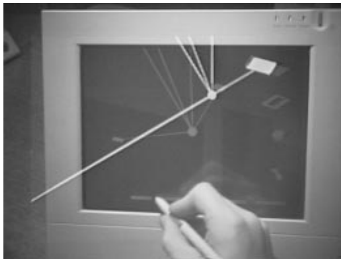
Figure 5: A simple interactive search mechanism creates 3D leader lines emanating from the tracked display to objects satisfying the query.

To experiment with hybrid interaction techniques, we implemented a simple 3D search function for virtual objects. A tracked display (acting simultaneously as a magic mirror or lens) presents the user with a set of sliders and buttons through which a subset of the objects in the environment can be specified by criteria such as their data type or size. A bundle of 3D leader lines in the virtual space connects the tracked display to the objects that meet the specified criteria, as shown in Figure 5). Since the leader lines are virtual objects, they are visible in the see-through head-worn displays as well as in the magic mirror. Readjusting the search criteria causes the set of leader lines to change interactively, implementing a dynamic query facility [1] embedded in the 3D world.