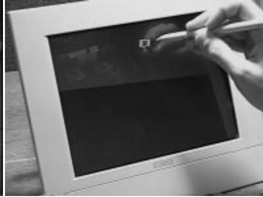
Figure 7: A user changes the privacy status of an object on the vampire mirror

implementations of both within EMMIE and discuss how they satisfy the above criteria.