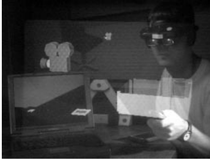
Figure 2: A user manipulates a 3D model with an optically tracked hand-held pointer. Other virtual objects shown include simple iconic 3D representations of applications (e.g., a “movie projector” that can play videos) and data objects (e.g., “slides” that represent still images).

contains graphical objects that visually appear to be located in the physical space.