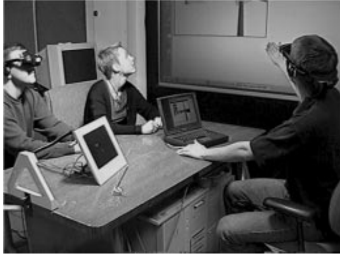
Figure 1: A meeting situation using EMMIE. Two users wear tracked see-through head-worn displays, one of whom has also brought in his own laptop. The laptop and a stylus-based display propped up on the desk are also tracked. All users can see a wall-sized projection display. The triangular source for one tracker is mounted at the left of the table; additional ceiling-mounted trackers are not visible here.

dynamically changing mix of displays and devices, allows information to be passed between 2D and 3D devices, and provides mechanisms for handling privacy in multi-user environments and services such as searching.