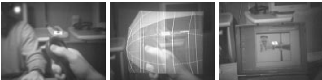
Figure 3: Drag & drop of virtual objects. A virtual object is picked up using a 3D pointing device (left image), dragged to a laptop, whose spherical bounding volume highlights, and dropped onto it (center image). The object then appears on the laptop's screen (right image).

By hybrid interaction , we mean those forms of interaction that cut across different devices, modalities, and dimensionalities [18, 35, 32, 33]. For example, to use a workstation in the physical environment and the wall-sized display connected to it to display an object in the 3D virtual space, we have to provide a way to move data back and forth between the 2D desktop of the workstation and the 3D virtual space surrounding us.