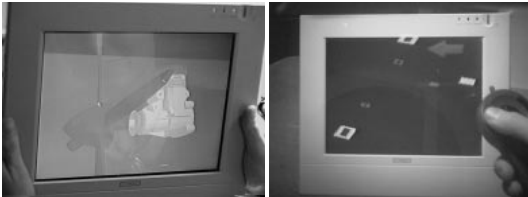
Figure 4: The same display tablet can serve as physical magic lens and magic mirror. In the left picture a user not wearing a HMD is looking through the magic lens at a 3D CAD object. In the right picture a user wearing a HMD has just dragged a virtual image slide in front of the mirror for further inspection.

In EMMIE, this transition between spaces is done by simple drag & drop mechanisms. The desktop of each workstation known to EMMIE provides a special icon representing the virtual space. By dragging any regular file onto this icon, a corresponding virtual object (3D icon) is created in the virtual space above the workstation's display. This 3D virtual object can now be manipulated with EMMIE's tools. It can be shared with another user by handing it over, or it can be dropped onto any workstation managed by EMMIE (see Figure 3), which makes the corresponding data available on the desktop of that workstation and starts up the application associated with its data type. The effect of these mechanisms is similar to the pick-and-drop technique presented in [32, 33] with an important difference: there is a visible and useful representation for the data in the virtual environment while it is being moved between the physical machines. (The presence of this representation also raises a variety of privacy issues, which we discuss later.)