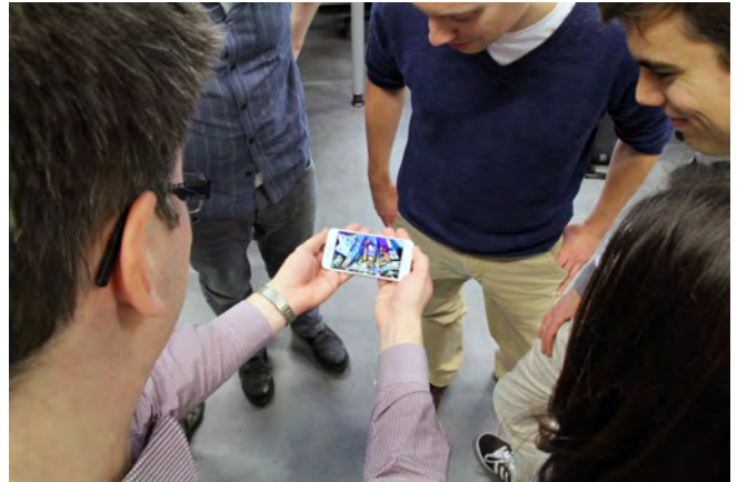
Figure 1. A group of people is simultaneously trying to look at a picture which causes a bad viewing experience.

Nowadays mobile devices are ubiquitous devices that contain advanced technology, such as cameras. Through the proliferation of digital cameras and cameras built into phones, more and more digital content is being produced. Hence, persons often find themselves in a situation where a digital picture or video has to be shared but the screen space is just too limited. Especially when showing digital content to several persons, the limited screen space results in a bad viewing experience for the viewers (see Figure 1). To solve this problem, Schönig et al. [16] suggested to extend mobile phones