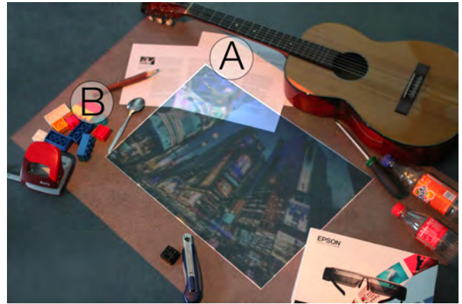
Figure 4. The prototype showing an image at a suitable position. The orange area is the whole projection area. (A) A feature-rich bright area is used for projection, too. (B) The area contains too many edges for a well perceived projection.

used the Canny algorithm [6] with a lower threshold of 240 and an upper threshold of 255. As an initial threshold for the brightness, we used a value of 170. If an edge is detected, the area 5 pixels around the edge is marked. Areas, where a SURF feature point is detected are also marked to contain a feature point within 3 pixels around the point.