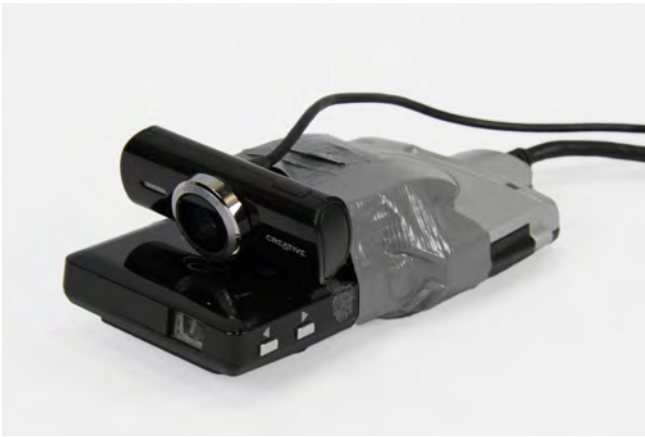
Figure 3. Prototype containing pico projector and simple web cam.

edges. The results indicate that surfaces with holes are perceived worse than flat surfaces for projecting content. These differences are significant for white and black surfaces. Additionally, the study indicates that surfaces containing edges are always perceived worse than flat surfaces and surfaces with holes. This trend is significant for white surfaces.