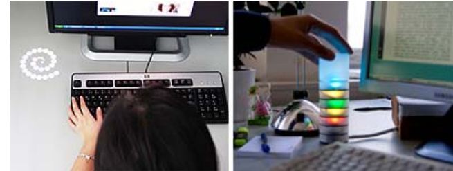
figure 1. Two prototypes: the ambient appointment projection (left) and the tangible presence indication (right)

coming appointments, which is projected on the users' desk. Once an event is coming close, the spiral starts pulsating to remind the user about the appointment.