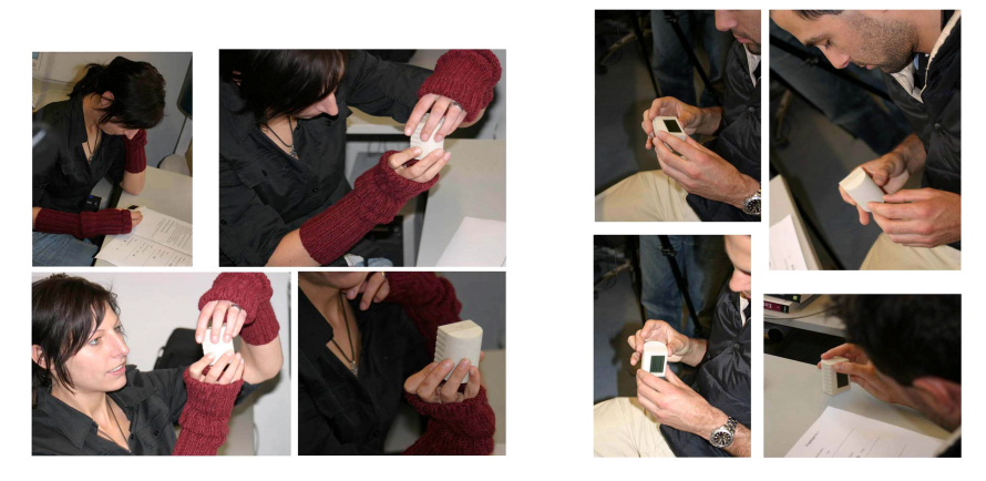
Fig. 3. The test person on the left hand side used the prototype as anticipated but first she used uncomfortable display positions till she figured out a better one. The other test person held the display in such away that it was not possible for him to see the text on the display