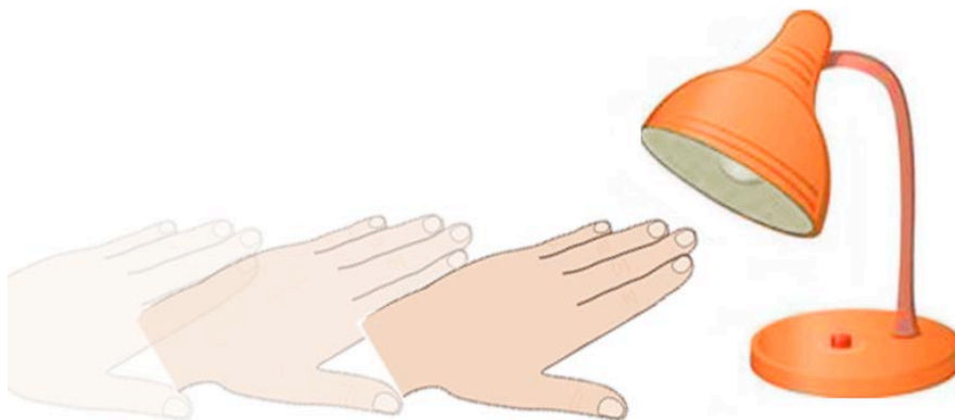
Fig. 1: Turning on the light by simply reaching towards the lamp

The tracking of the hand and its movements can be realized by using infrared distance sensors, which are integrated in each device in a reachable distance to the user. By interpreting the values of all active sensors, the system is able to detect the single device a user is reaching for.