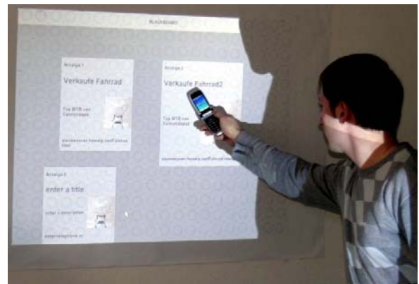
Figure 1. Interacting with an advert on the NFC- billboard

This paper investigates the application of this novel technique for mobile interaction with physical interfaces as it builds upon the technology of the dynamic NFC-display to implement an advertisement billboard. In the prototype, the interface of the billboard with its different advertisement snippets is projected onto a grid of 20x15 NFC-tags. Figure 1 shows how users can interact with adverts by touching the tags of the NFC-grid with their NFC-enabled mobile devices. That way, they can also download and store adverts from the NFC-display, create new adverts on the mobile device and upload them to the display.