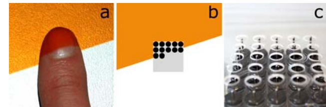
Figure 3 - Closed interaction loop of the EdgeMatrix system. The finger's movement is tracked (a), a virtual sensor matrix computes hit-tests (b), the corresponding individual tactile actuators are triggered (c).

be described as follows: An interactive surface is created by projecting a graphical user interface on a table. The exploratory movements of the user's finger in the GUI are tracked optically using an infrared camera. The information is translated into a set of signals using the open source multi-touch tracking application CCV 1 . Finger positions are sent via TUIO protocol 2 to the main application that is responsible for controlling interactive elements, visual display, and tactile output. The exploratory movement of the user's finger affects the sensor modality; the interaction loop is closed (see Figure 3).