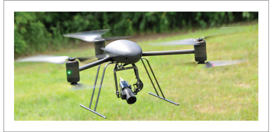
Figure 2. Camera mounted to a Draganfyler X6 drone.

out of users' desire to improve the camera's video capabilities. Magic Lantern targets audio and video limitations of Canon SLRs. Similarly, the Canon Hack Development Kit (http://chdk. wikia.com) enhances the capabilities of consumer cameras with features from SLRs and with scripting capabilities.