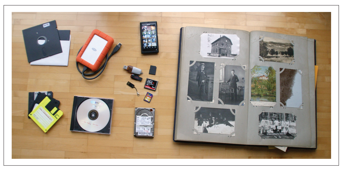
Figure 3. The short-lived digital storage solutions are a stark contrast to a traditional album of photos.

requires users to fully trust the quality of the service. Although such services seek to establish trust, the recent discussions around users' privacy in online systems might negatively affect users' willingness to move personal photos online.