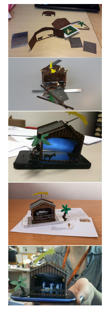
Figure 3: Examples of photos posted on Facebook by recipients of the Christmas card.

the manger has been placed on the touchscreen, an animation of the Christmas story is played exactly underneath the manger. This Christmas animation is visible inside the manger from its front through a mirror placed diagonal inside the manger similar to Broy et al. [1] (cf., Figure 1 – right). Thus, the pTUI contains a display that can show arbitrary content inside the pTUI and seen from its front side.