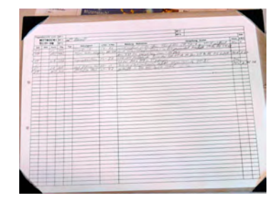
Figure 4: Documentation of major events.