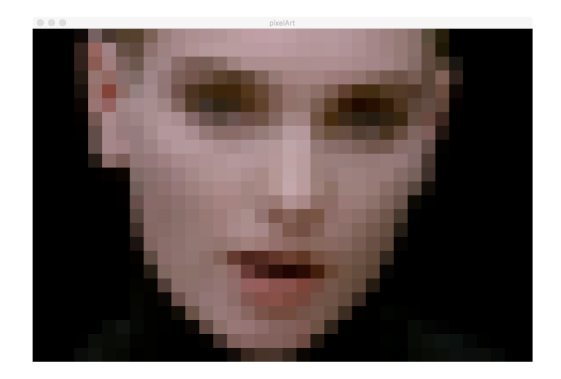
Figure 3.2: Resulting Image from the example code.