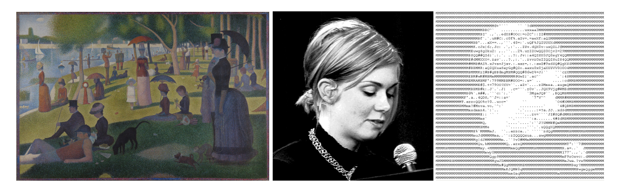
Figure 3.1: The shown examples demonstrate the translation of a color information to a interpreted output.

Implement a program that takes an image as an input, analyzes the content and transfers it to a new output design. As an example look at pictures from Pointilism, ASCII art, etc..