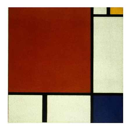
Figure 2.1: Example of a Mondrian Painting.

Following this idea, the first task of the book is to use Processing to recreate a mondrianesque image. Implement a program that creates a drawing that is inspired by Mondrian.