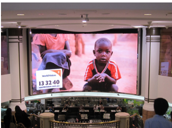
Figure 1. (a) Prototype of an interactive digital Morris Column, (b) Large cylindrical display of the Fashion Catwalk in Dubai Mall, (c) Curved display wall in Westfield Sydney Shopping Centre