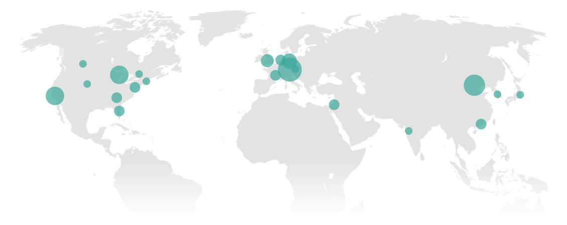
Fig. 3. Research on affective automotive UIs has been predominantly carried out in geographical proximity to major car producers and pertinent research institutes. Circle area represents publication count per region.

office [50], an idea which stands out as positive example because DMV visitors who come for official business regarding their driver's license or car registration are most likely engaged in the current car market and thus might represent a relevant sample group.