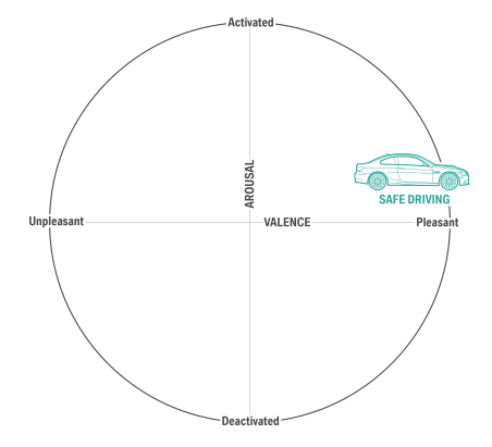
Fig. 1. Model of driving performance based on valence and arousal as proposed by Cai & Lin [21]. Best performance is expected at medium arousal, derived from the law of Yerkes & Dodson [118].