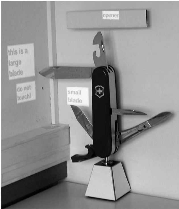
Figure 3: Annotation of a complex real world object

object and its super-objects in the part-of hierarchy is then evaluated according to a weighted set of criteria. The most obvious criterion is the distance of the display surface to the annotated (or reference) object. Near surfaces are rated higher than far ones. Making an annotation non-ambiguous means that it should be visibly closer to its reference object than to all other objects.