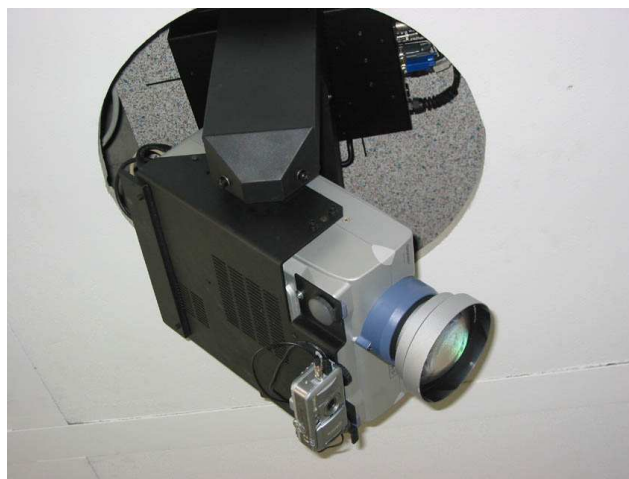
Figure 1: The steerable projector used in our environment

Instrumented environments are one way of exploring ubiquitous computing scenarios within limited areas of space. Instrumentation can be achieved by various kinds of sensors and actuators, including conventional displays, cameras and projectors. The SUPIE (Saarland University Pervasive Instrumented Environment) is one example of such an instrumented environment in the size of a regular office, and one of its central elements is a steerable projector-camera unit mounted on the ceiling in the middle of the room (see figure 1). One core idea is that the steerable projector-camera unit turns the whole room into a large display continuum, where other displays are consistently integrated as areas of higher resolution and enhanced interactivity. A conceptual model for this was presented in [3]. The steerable projector might eventually be substituted by electronic wall papers or carpeting with display capabilities, and we try to develop interaction concepts which will then still remain usable. One way to make an instrumented environment interactive is to visually create interactive elements in it. A straightforward approach is to transfer concepts from our current direct manipulation or WIMP (Windows, Icons, Menus, Pointing device) interfaces to such an environment. In our earlier work, we have already presented a search functionality for physical objects [4] which uses simple spots of light to highlight physical objects using a steerable projector.