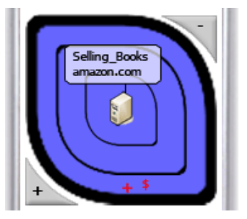
Figure 4: Service centered view.

In addition to this so called datatype view (Figure 3 left) of the preferences the users can switch to a services view (Figure 3 right) where services are shown as symbols around the user instead of datatypes. This view can be used to alter preferences for a specific service only. Here, the distance to the center is interpreted as how much the user trusts the service.