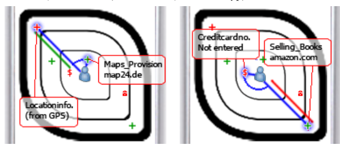
distance(User,Service) > distance(User,Datatyp) != disclose

Because the distance of the service and the user is greater than the distance of the datatype and the user, the service won't get this data.