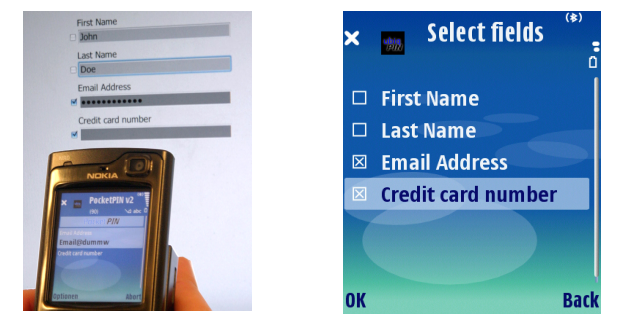
Figure 2: Interaction with the prototype (left) and selection of private input fields using the mobile phone (right)

the data has been successfully submitted. This approach is illustrated in steps 4 and 5 in Figure 1.