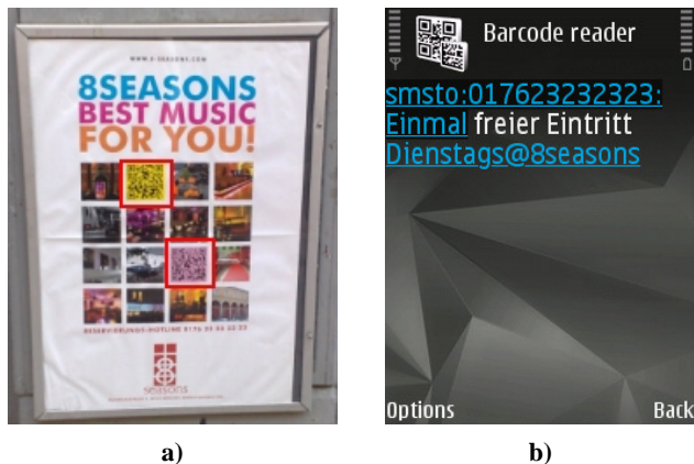
Figure 1. Visual marker on a poster (a; red squares) as physical hyperlinks for sending a text message (b)

Opposite to the mere presentation of information from tags, applications using physical hyperlinks assign information to specific actions, e.g. opening a link in a web browser or calling a phone number, which is automatically triggered upon “clicking” on a physical hyperlink