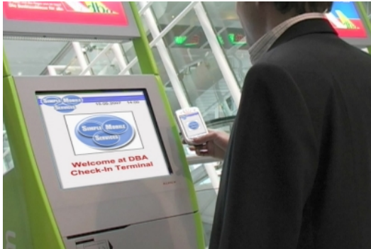
Figure 3. 2-way-interaction with an airport terminal (SMS mock-up)

The interaction patterns and PMAs from the previous categories show the simplicity behind PMI. Mobile devices either acquire information from physical objects or provide information themselves in a single interaction step. More complex PMAs carry out more demanding tasks and often comprise several interaction steps with more intelligent objects that actively communicate with mobile devices thus implementing a mutual 2-way interaction between them. An example from the SMS project is the interaction with a check-in terminal at an airport that requires the user to provide information in several steps (see Figure 3). Another example is mobile payment that could comprise several interaction steps to carry out a transaction.