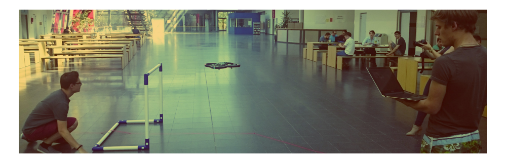
Fig. 3. Impressions from the autonomous drone race competition. Four student teams had to program a Parrot AR Drone 2.0 in order to fly autonomously in a drone race. In this picture a semi-autonomous interaction using face recognition is depicted.

3 (recognition of a human face) mentioned difficulties regarding the ease of use due to a lack of robustness of the associated algorithms. External factors such as different lighting, fast movements of the tracked object, and a lack of control mechanisms (e.g., a PID controller) led to difficulties in the interaction with the drone. The participants highlighted that they had difficulties "If the background is too bright, it [did not] work [recognition of a light source]" [P4]. and while "Holding it stable, while moving, shaking it not too much, was difficult" [P3].