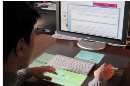
Figure 1 Magic Desk [2]