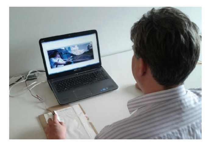
Figure 4: A participant is performing the video rating task.

At first, we compared the subjective measurement (VR - cf. Figure 4) with the objective measurements (SCR and BTemp). Hence, we conducted correlational research comparing the VR to the physiological values using Pearson's correlation coefficient. The SCR and VR, r(17725) = .202, p < .001, as well as the BTemp and VR, r(17725) = .128, p < .001, are positively correlated. The correlations are both statistically significant, however, the effect size is small.