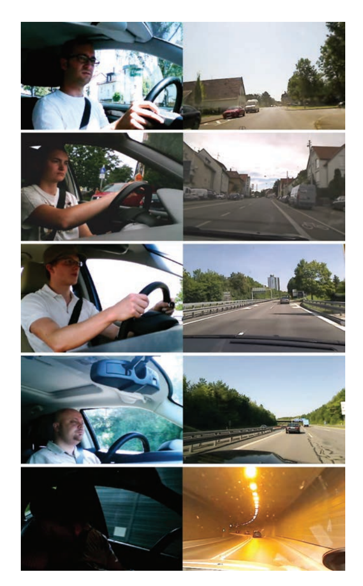
Figure 2: The five different road types: 30 km/h zone, 50 km/h zone, highway, freeway, and tunnel. The view of the driver camera is shown on the left side and the front view on the right side. This side by side composition video was shown to the participant during the video rating session.

The selected route for our study has a total length of 23.6 km and consists of various road types (cf., Figure 3). For the evaluation of our study, we classified five different road types: 30 km/h zone, 50 km/h zone, highway, freeway, and tunnel. The tunnel in general is an ordinary road. However, we choose to add it as a special road type, because of the special conditions that may influence the driver (e.g., lighting). Furthermore, we defined different points of interest: 2x on-ramp, 2x freeway exits, 2x roundabouts, 20x traffic lights, and 2x curvy roads. Due to the fact that we conducted a real world driving study, we cannot control the environment (e.g., traffic, weather). However, we strove for a consistent setting among all participants: none of the participant drove during rush hours and the study was only conducted during daylight.