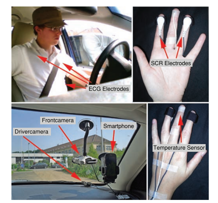
Figure 1: Study setup: Two cameras and a smartphone are placed within the car (bottom left). The driver is connected to electrodes measuring the Heart Rate (top left). Skin Conductance Response (top right) and Body Temperature (bottom right) are measured at the drivers left hand.

http://dx.doi.org/10.1145/2516540.2516561