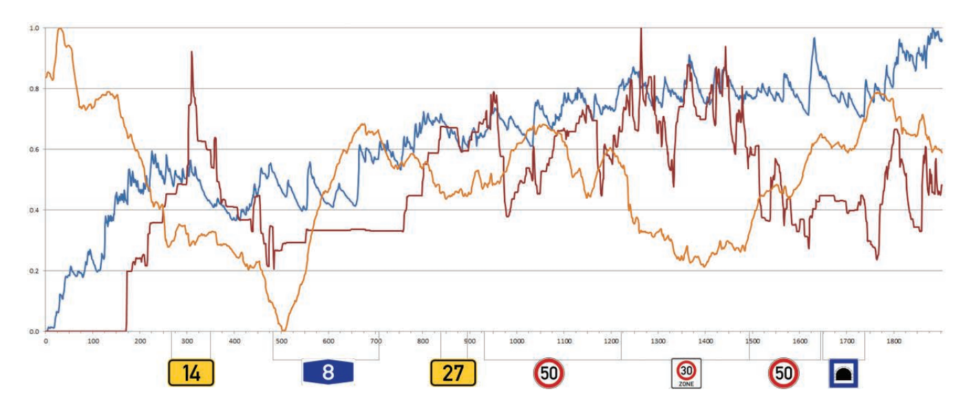
Figure 5: The Graph shows the normalized Skin Conductance Response (blue), normalized Body Temperature (orange), and the normalized result from the Video Rating (red) of a single user (User #10).