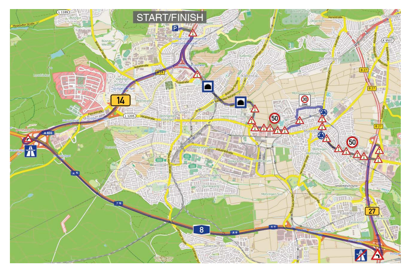
Figure 3: Map of the route each participant drove during the study. Each type of road is marked accordingly (A8: freeway, B14/B27: highway, ordinary streets (50\,\mathrm{km/h}) , 30\,\mathrm{km/h} zone. All points of interest (freeway on-ramp/exit, roundabout, traffic lights, roundabouts, tunnel entry/exit) are shown with the respective symbols.

conducting an own study. We believe the data set has a value for the research community and we believe this could be a starting point for building a larger collection of data sets.