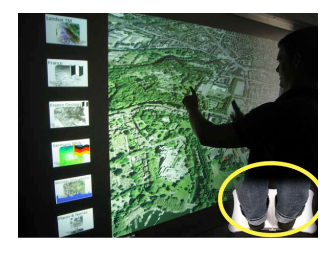
Figure 1: User is interacting with both hands and feet with a virtual globe using a large size multi-touch wall. User is standing on a Wii balance board (marked with yellow circle).

mouse input using the WIMP desktop metaphor. After experiencing the potential of multi-touch, users tended towards more advanced physical gestures [17] to solve spatial tasks, but these gestures often were single hand gestures or gestures, in which the non-dominant hand just sets a frame of reference that determines the navigation mode, while the dominant hand specifies the amount of movement. For example the tilt operation was mostly performed by pressing the non-dominant hand flat on the screen and by moving the dominant hand up and down to adjust the tilt angle. Motivated by these observations, we developed a method by which users can perform actions on a large-scale multi-touch wall with both hands and with their feet by shifting their weight over their feet on a Wii Balance Board [9].