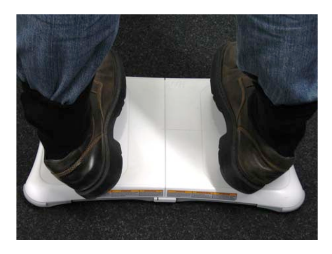
Figure 2: Foot waiting gesture. People waiting often standing on her sidefeets. This interaction can be used to return to the home screen.

with the feet (e.g. a "waiting gesture"; people waiting often standing on her sidefeet as can be seen in figure 2).