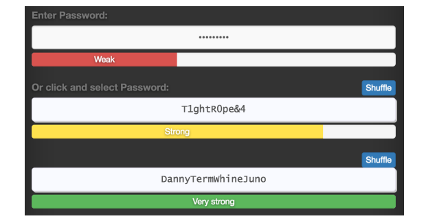
Fig. 1. The Decoy Password Generator evaluates and suggests passwords. The first suggested password is the 'decoy', which is difficult to type and not optimally strong. The second is the 'target', an easy to type and supposedly easy to remember password.

http://dx.doi.org/10.14722/eurousec.2016.23002