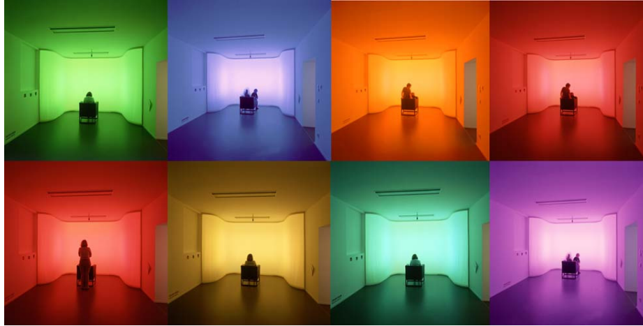
Fig. 3. Implementation: Different colors generated through diverse seating positions