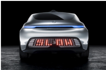
Figure 2: Concept car by Mercedes Benz equipped with a low-resolution display.