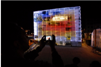
Figure 1: Low-resolution media façade of the ARS Electronica Center in Linz, Austria.